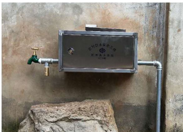
Field Installation of Water Systems

Designed for water system freeze protection, the anti-freeze valve automatically activates as ambient temperatures drop and water temperatures approach the freezing point, initiating a "drip-based" protection mode. As the discharged water cools further, the valve autonomously increases the drainage rate to effectively balance heat loss within the system. Once the water temperature recovers, the valve automatically closes. This mechanism ensures robust freeze protection while minimizing water consumption, offering a truly green and eco-friendly solution.